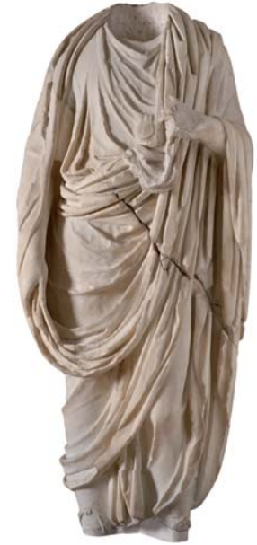
Robe, s. I aC

And you, do you have any kind of amulet?