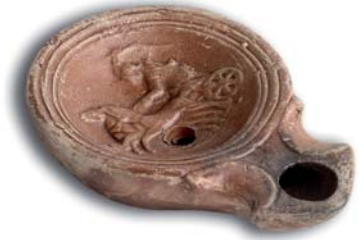
Roman lamp, s. I aC

Although the use of lamps will be very widespread in Roman times and they used molds to make them, today we propose you to make one manually to experience how the lighting would be at night.